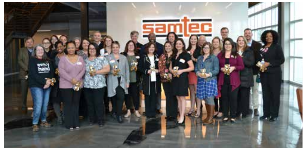
Winter 2018 Grant Recipients

Dare to Care, Inc. will use grant funds to support their Feeding Families outreach in Clark, Floyd, Crawford, Harrison and Washington counties.