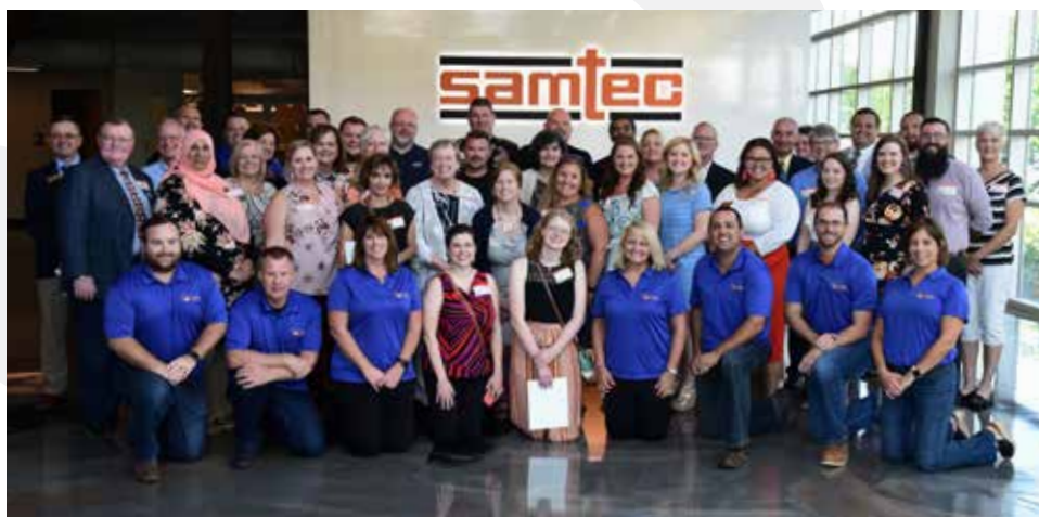
Summer 2019 Grant Recipients

Hero Reward provides U.S. service men and women, as well as emergency responders, a one of a kind retreat to aid in both mental and physical recovery from traumatizing events. Their grant will be used to expand their Healing Without Walls Program, an alternative to traditional forms of rehabilitation and counseling.